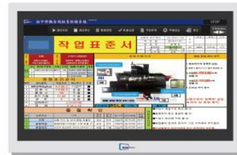
Work operation sheet