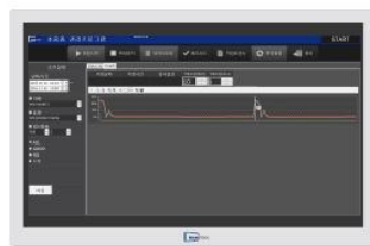
Data search screen